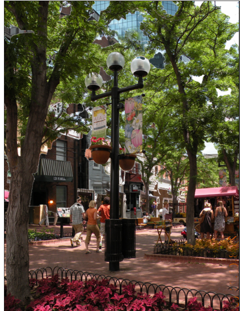
Mill Street PED Mall